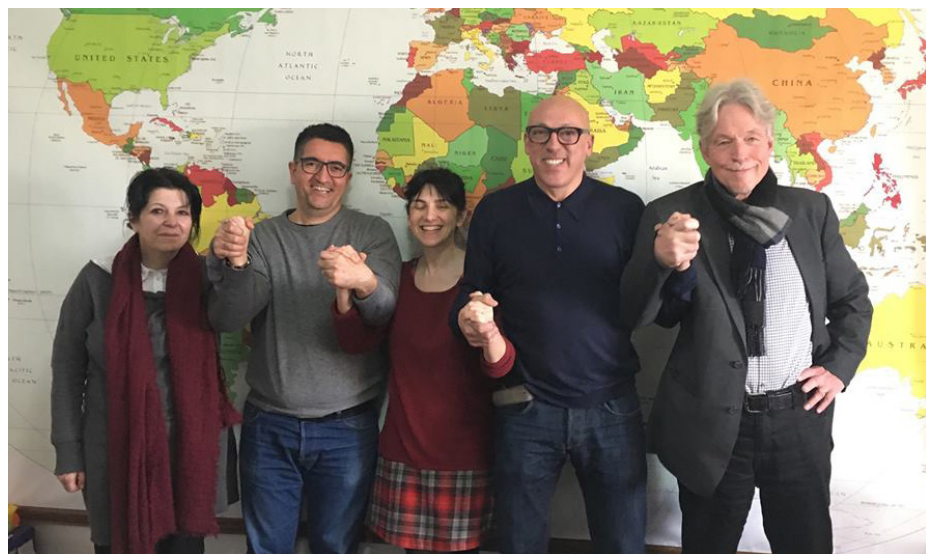
DfP board at A.C.T.O.R's office, in Bucharest