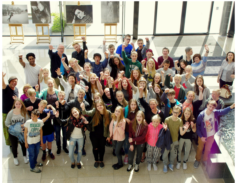
Full-group, Wejherowo-exchange in Poland

and qualitative research data indicate that the investigated international youth exchanges have a significant