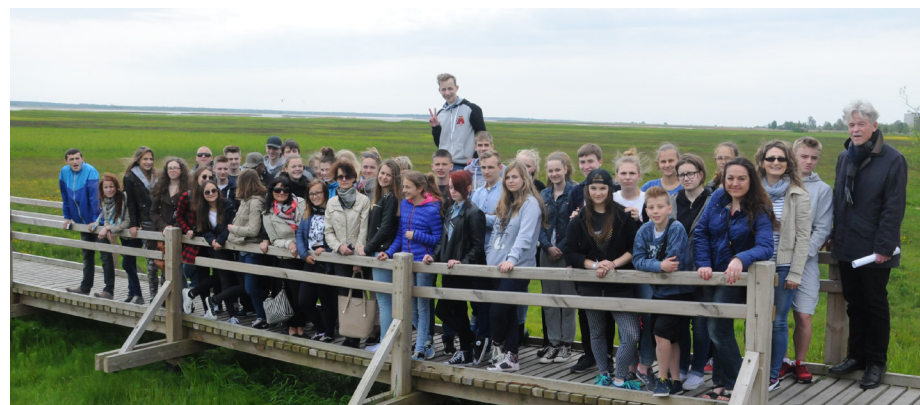
Full-group, exchange in Liepaja. Latvia

They show a positive development at participants, which is above the one found at a control-group, who didn’t go anywhere.